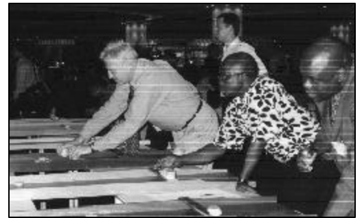
Serious fun at the post-poster party, "Wednesday Night Fever"