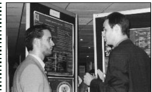
Serious discussion at the poster session